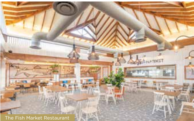
The Fish Market Restaurant