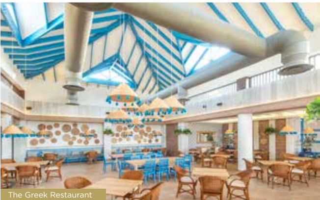
The Greek Restaurant