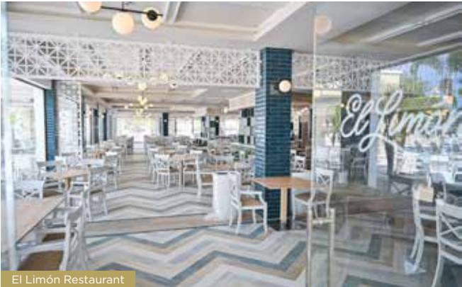
El Limón Restaurant